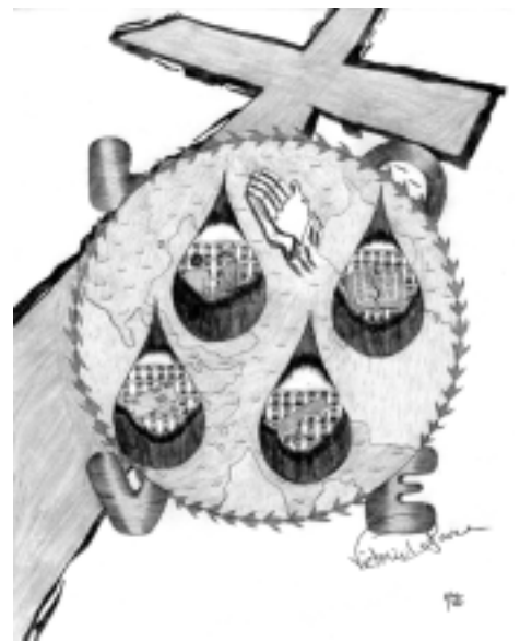
by Victorio DeLance(FDCF)